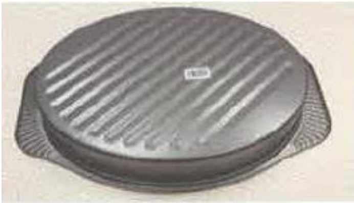
Good Cook Jumbo Roaster roasting pan bottom