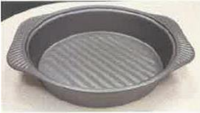
Good Cook Jumbo Roaster roasting pan top